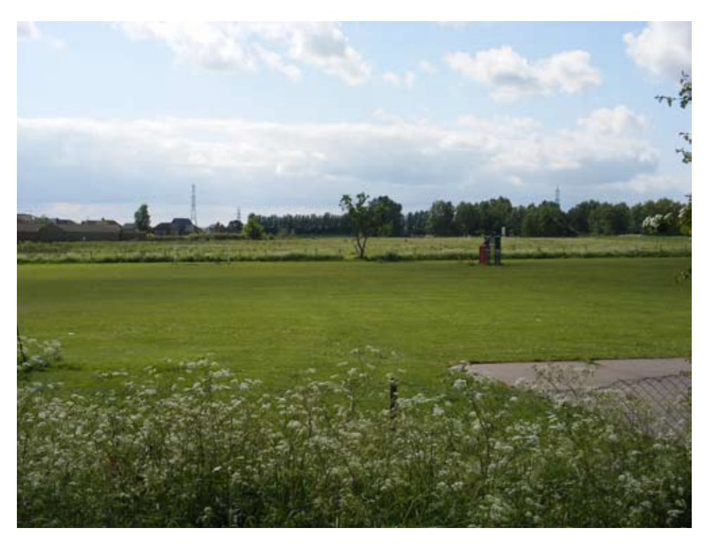
Fig 2. recreation ground located to the south of School Lane and forming part of the site