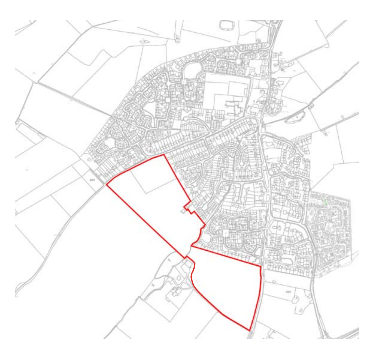
Fig 4. Iwade village, with site extent shown in red