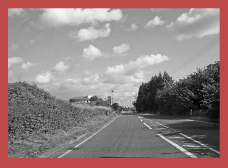
chapter one: introduction