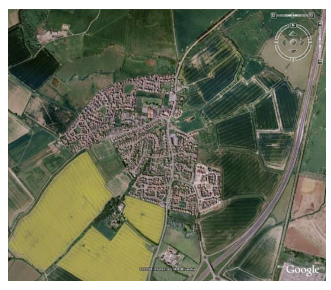
Fig 1. Iwade aerial image